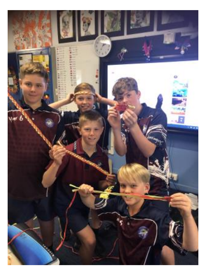
Beanies for Brain Cancer