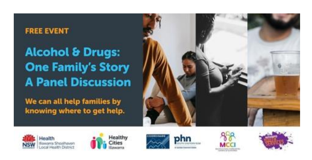
1 - Please click on this link for more details ^1