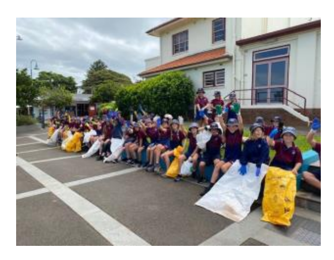
CONGRATULATIONS WAVE WINNERS!